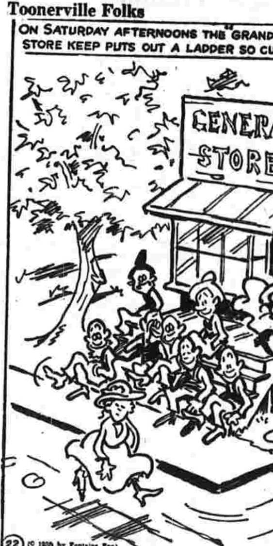
TOONVILLE FOLKS By Fontaine Fox

ON SATURDAY AFTERNOONS THE GRANDSTAND GETS SO CROWDED THAT THE STORE KEEP PUTS OUT A LADDER SO CUSTOMERS CAN GET INTO THE STORE.