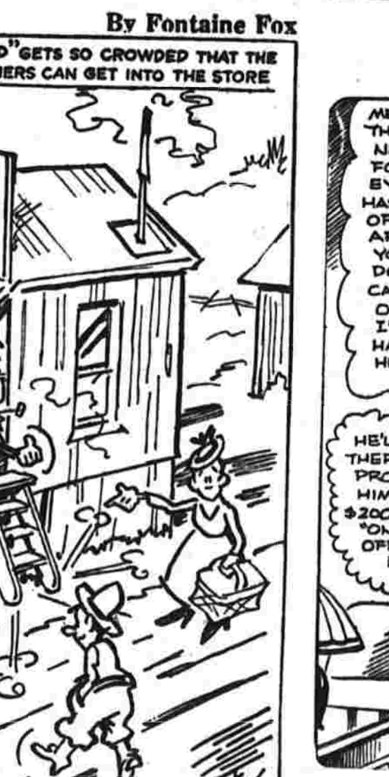
OUR BOARDING HOUSE By Martin

ME TAKE $50 FOR THIS GLASS BEVE? NUP! YOU CAN'T FOOL ME ON GLASS BEVE—THIS ONE HAS THE COLORING OF A WORK OF ART—I'LL TELL YOU WHAT I'LL DO AMONG 'EM CAUSE YOU'RE MY OWN BROTHER.